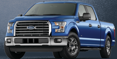
2015 FORD F-150