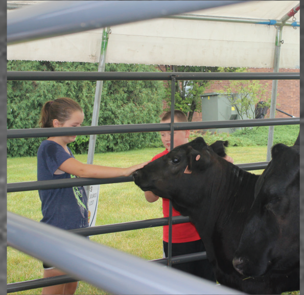
TOP LEFT: STUDENTS SEARCH FOR THE QUEEN BEE TOP RIGHT: CALI'S CALF ENJOYS METING THE STUDENTS