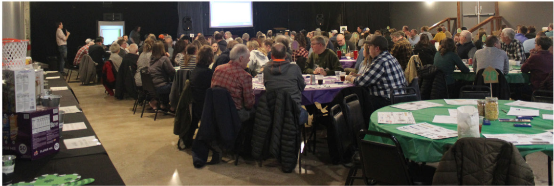
2022 Foundation Trivia Night