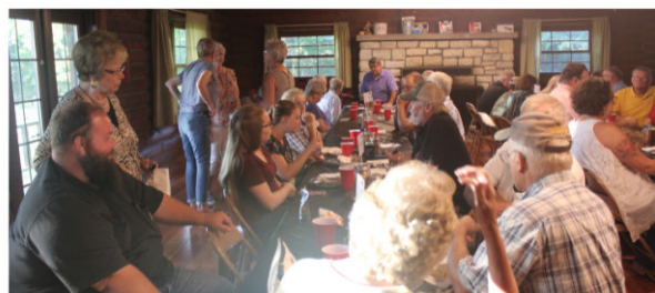
Volunteers enjoyed a relaxing evening at the first Volunteer Appreciation Event.