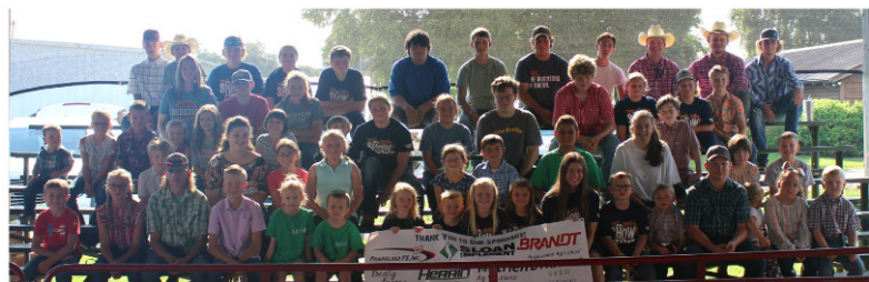
Exhibitors of the 2022 Youth Expo