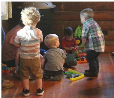
(Left) Children of SCFB Members at play during the Volunteer Appreciation.