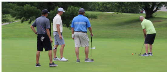
2022 Foundation Golf Outing