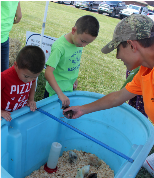
Top Right: Kids being educated on poultry at Ag-Stravaganza.