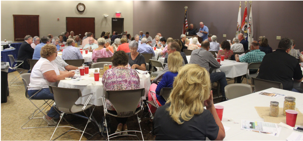
Top Left: 2017 SCFB Annual Meeting