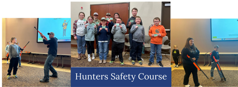
Hunters Safety Course