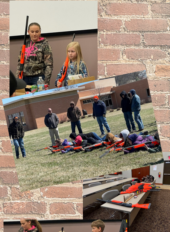
SCFB Hosts First Ever Hunter Safety Course!