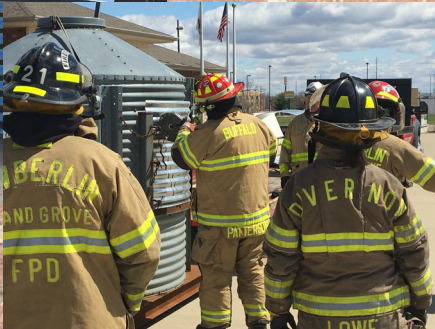
Watch for Future Events!