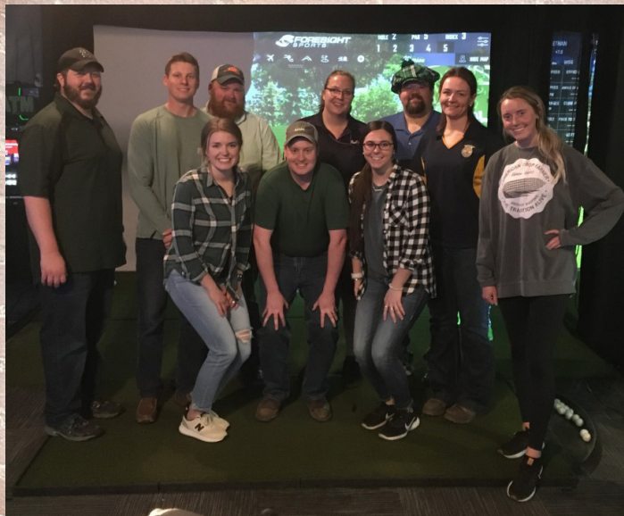
Young Leader Committee Visit The Back 9 Golf Simulator!