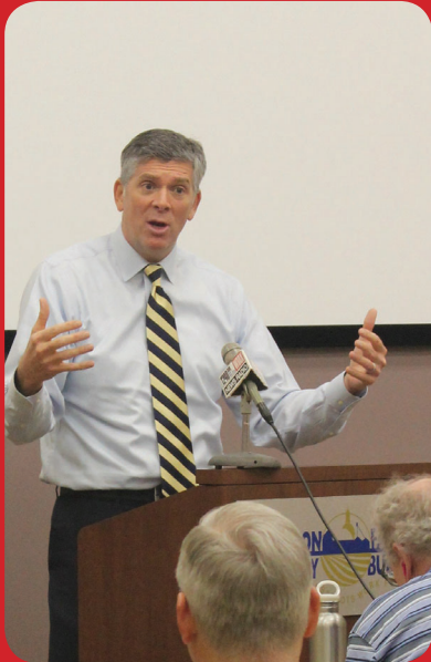
Congressman LaHood talks with the members of the Sangamon County farming community.