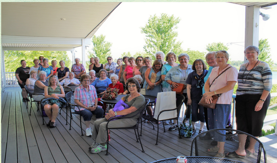
The Women's Committee Bus Trip spent the afternoon at the Machinaw Valley Vineyards in Machinaw after shopping and lunch at Grainte City Food and Brewery in Peoria.