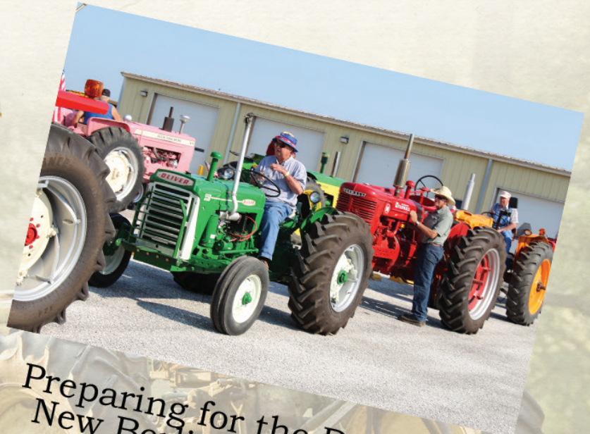
Preparing for the Drive at New Berlin High School