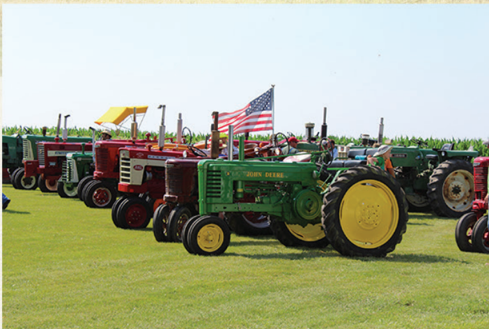
Tractors lined up at the King Farm