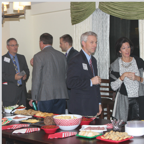
Bottom Left- Guests enjoy the Legislative Reception.