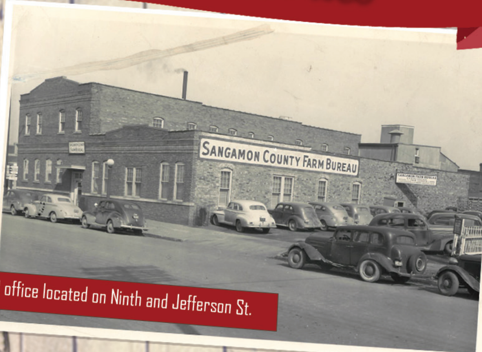
SCFB office located on Ninth and Jefferson St.

If you have time honored photos related to Sangamon County Farm Bureau we would love to see them. We can easily scan them to preserve the photo and to share with the rest of our members!