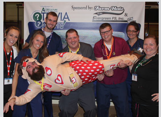
Bottom Right- The Young Leader's dressed up as the cast of Grey's Anatomy.