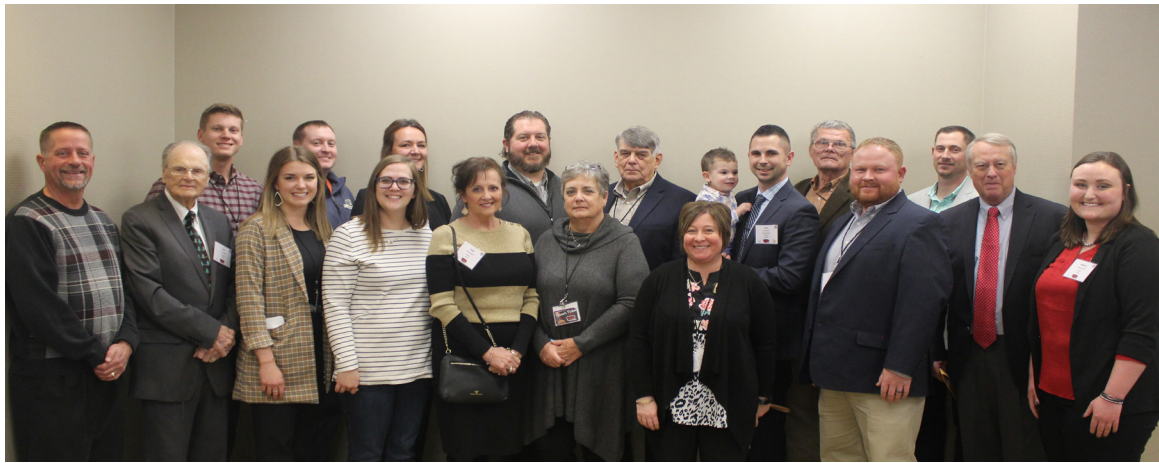
Sangamon County Farm Bureau attendees at the 2022 IAA Annual Meeting