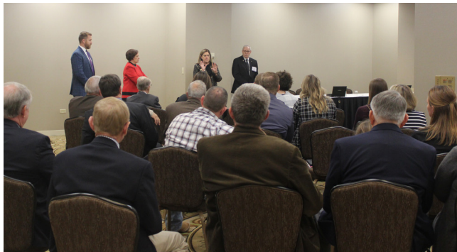
Sangamon County Farm Bureau attendees sit in on District 10 meeting.