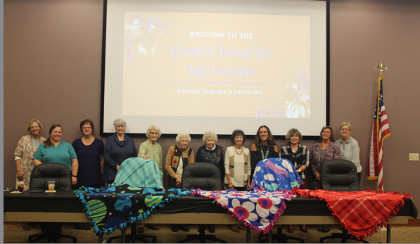
A time of fellowship & giving back to the community!