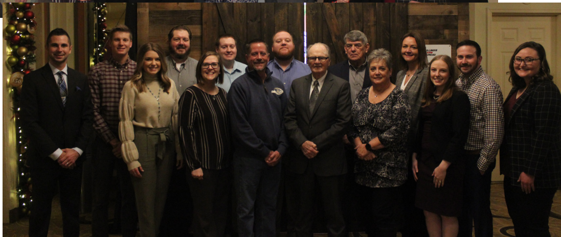
Sangamon County Farm Bureau attendees at the 2021 IAA Annual Meeting